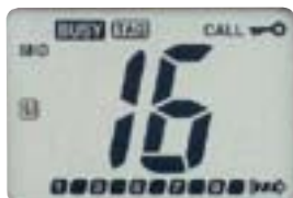
The photo shows actual display size.