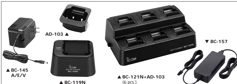
▲ BC-145 A/E/V ▲ AD-103 ▲ BC-119N ▲ BC-121N+AD-103 (6 pcs.) ▼ BC-157

BC-150 DESKTOP CHARGER + BC-147A/E AC ADAPTER Regularly charges the battery pack, BP-224 in 8 hours (approx.). Same as supplied.