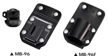
▲ MB-96 ▲ MB-96F

MB-96 : Swivel belt hanger. MB-96F : Fixed type belt hanger. For use with MB-68 or MB-74N.