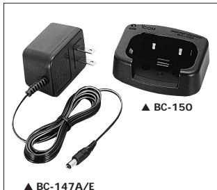
▲ BC-150 ▲ BC-147A/E

BP-223 BATTERY CASE Battery case for AA (LR6)×6 alkaline cells. BP-224 BATTERY PACK 7.2V/750mAh Ni-Cd battery pack. Provides 8 hours* operating time (approx.). *(Tx (HI): Rx: standby=5:5:90).