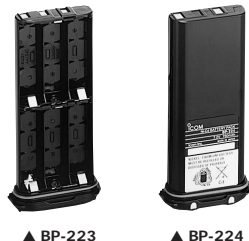
▲ BP-223 ▲ BP-224

BP-223 BATTERY CASE Battery case for AA (LR6)×6 alkaline cells. BP-224 BATTERY PACK 7.2V/750mAh Ni-Cd battery pack. Provides 8 hours* operating time (approx.). *(Tx (HI): Rx: standby=5:5:90).