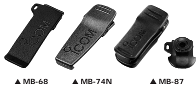
▲ MB-68 ▲ MB-74N ▲ MB-87

MB-68 : Standard flat belt clip for attaching to your belt. MB-74N : Alligator type. Clips to almost anything in a variety of convenient places. MB-87 : Swivel belt clip. Prevents accidental dropping from your belt. Same as supplied.